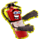
USFA Kids Page

Wanna find out why diseases tremble in fear when they hear the CDC's name? Follow CDC Disease Detectives as they track down the sources of disease. http://www.bam.gov/sub_diseases/diseases_detectives.html