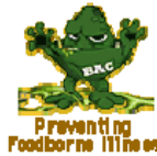
Preventing Foodborne Illness

Smokey Bear - Only you can prevent forest fires http://www.smokeybear.com/kids/default.asp Preventing Foodborne Illness – US Dept. Agriculture http://www.usda.gov/news/usdakids/index.html